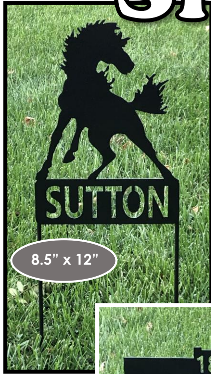
8.5" x 12"