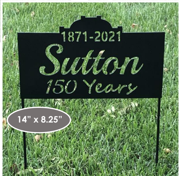
14" x 8.25"